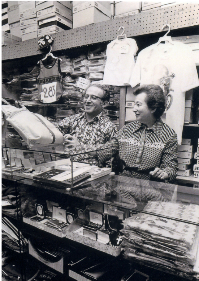
Shaffer's Dept. Store